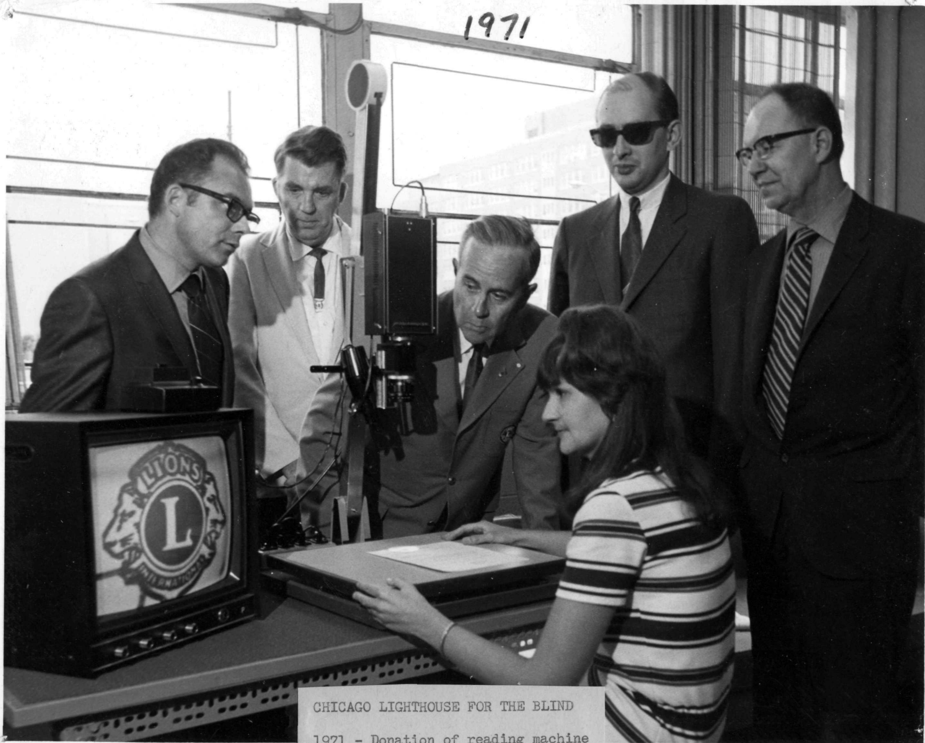
CHICAGO LIGHTHOUSE FOR THE BLIND 1971 - Donation of reading machine