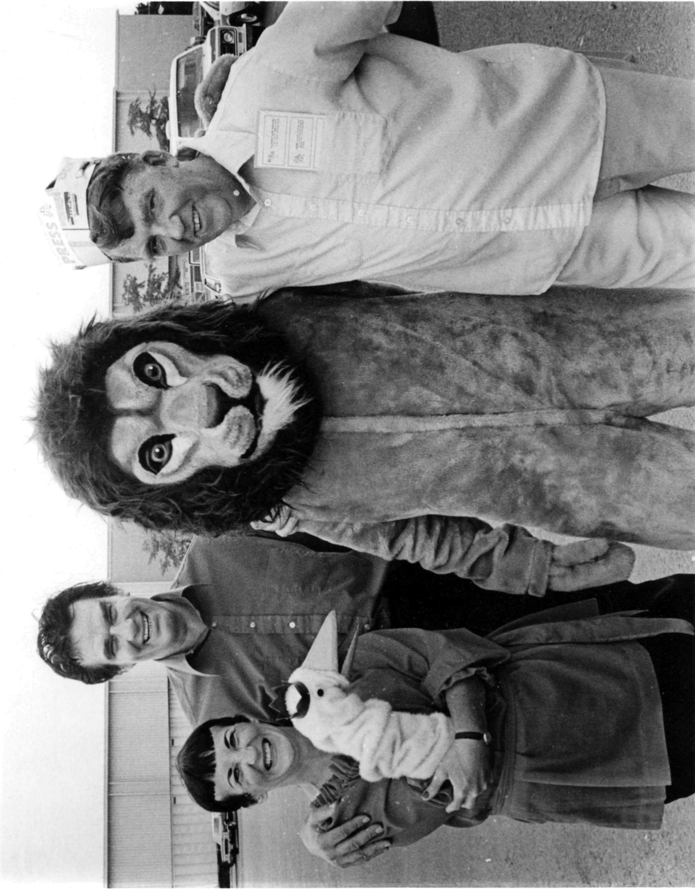
LION DOC TAMMOR & GARFIELD GOOSE & LOON AT FAIR ON WICKES LOT