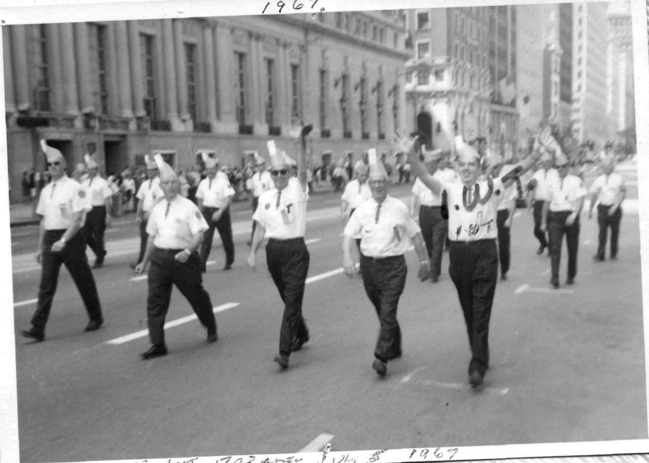
LIONS INT. PARADE JULY 5 1967